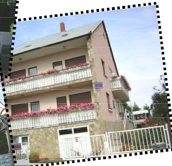
Budai Nagy Antal Street 14.

One of our houses is situated in the city centre, the other two houses can be found in a calm, peaceful environment. They are 50 metres away from each other and 1,000 metres from the thermal spa of Hévíz. The apartments are suitable for 2-6 people. We are member of the Association of Accommodation Providers in Hévíz thereupon our guests have allowance from many services (spa ticket, treatment, restaurant, travel agency, hairdresser, cab, etc.).