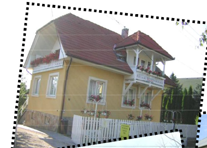
Veres Péter Street 11.