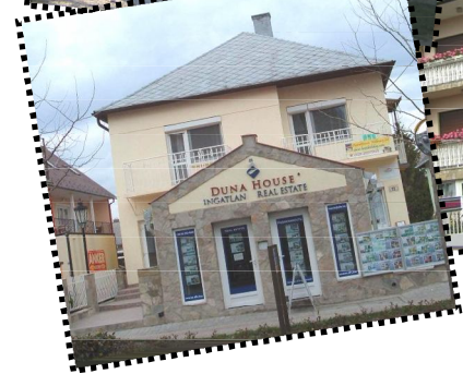
Széchenyi Street 12.